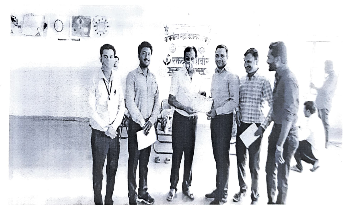
Donors receiving certificate from the Principal