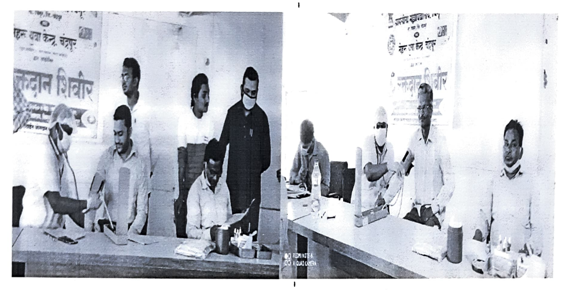
Medical check-up before donation