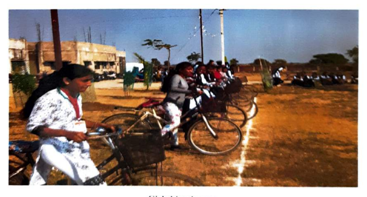
Girls bicycle race