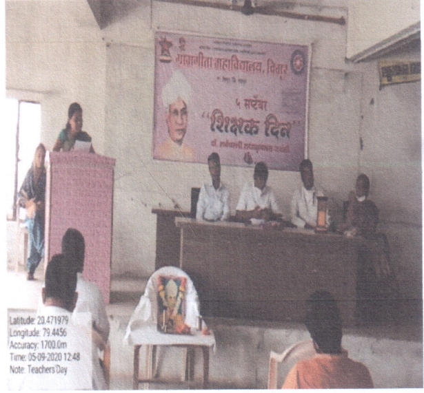
Latitude: 20.471979 Longitude: 79.4456 Accuracy: 1700.0m Time: 05-09-2020 12:48 Note: TeachersDay