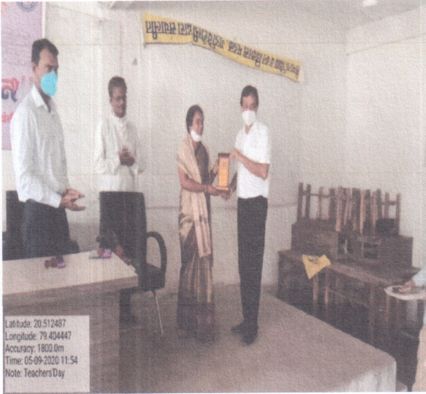
Latitude: 20.512487 Longitude: 79.404447 Accuracy: 1800.0m Time: 05-09-2020 11:54 Note: TeachersDay