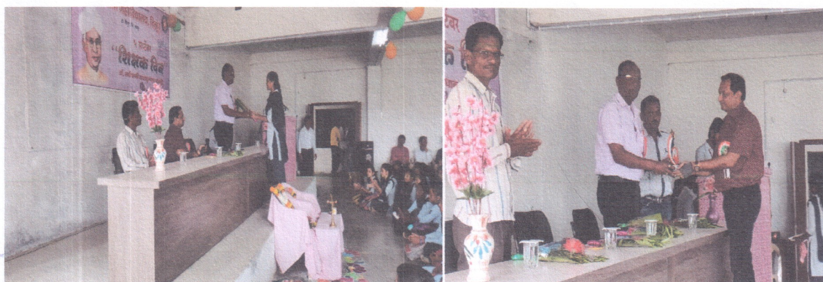
Rangoli, Poster etc Competition and Teachers day celebration during Fortnightly Social Awareness Program