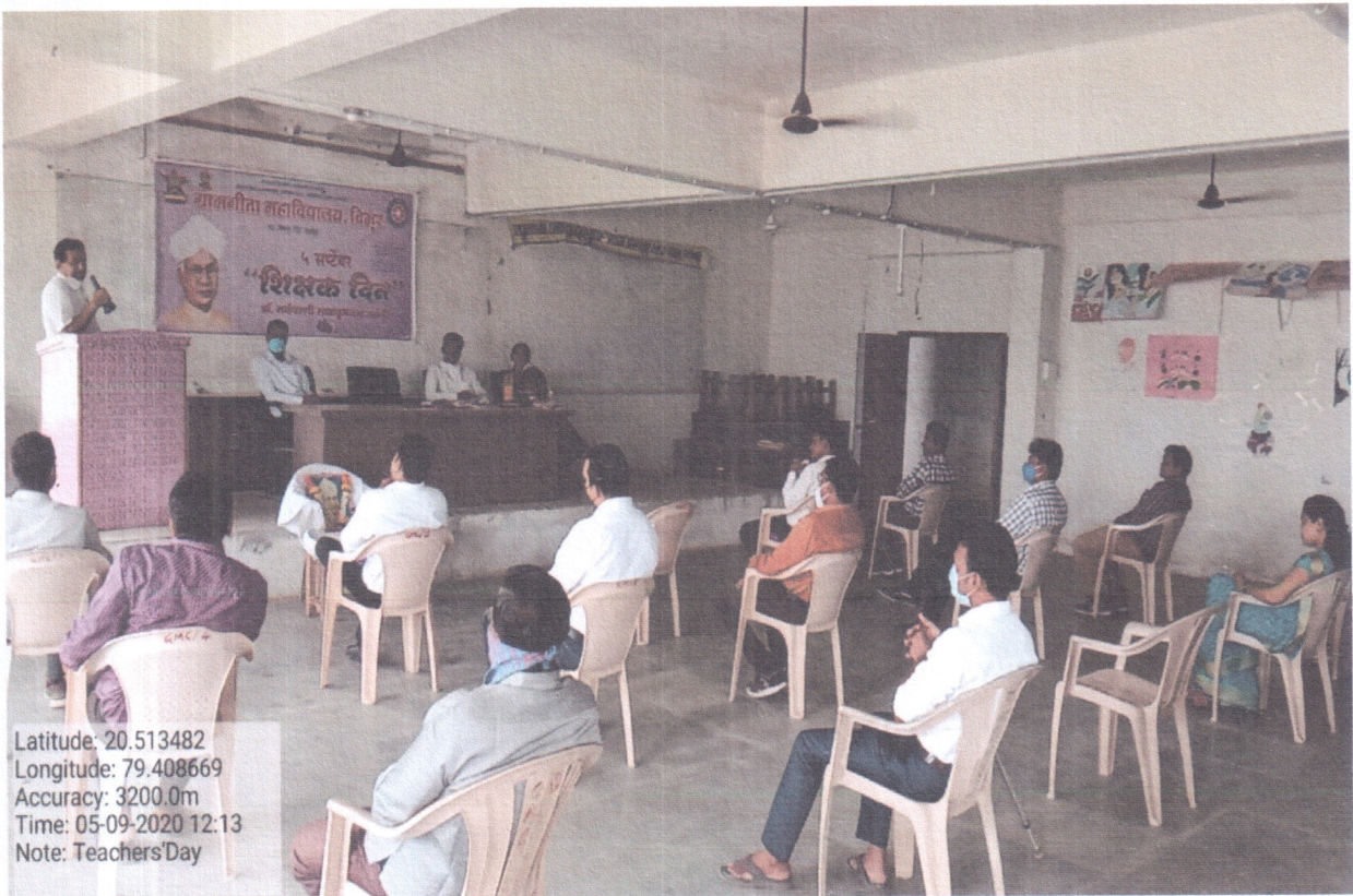
Latitude: 20.513482 Longitude: 79.408669 Accuracy: 3200.0m Time: 05-09-2020 12:13 Note: Teachers'Day