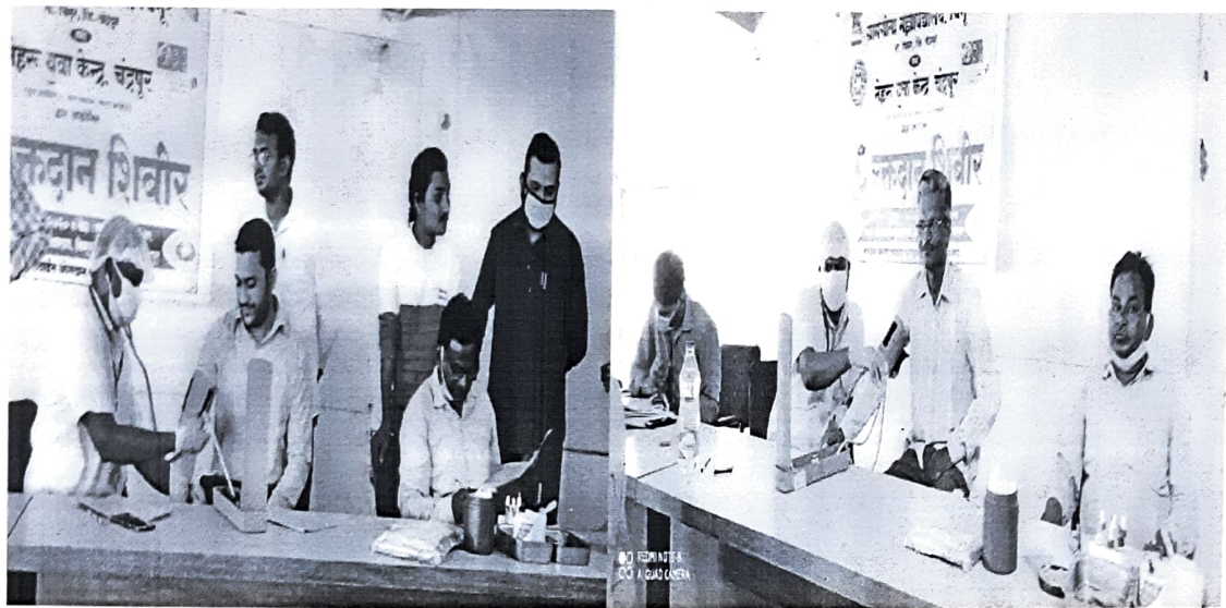
Medical check-up before donation