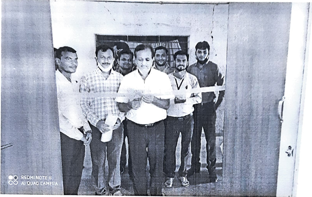
Principal Inaugurating the Camp